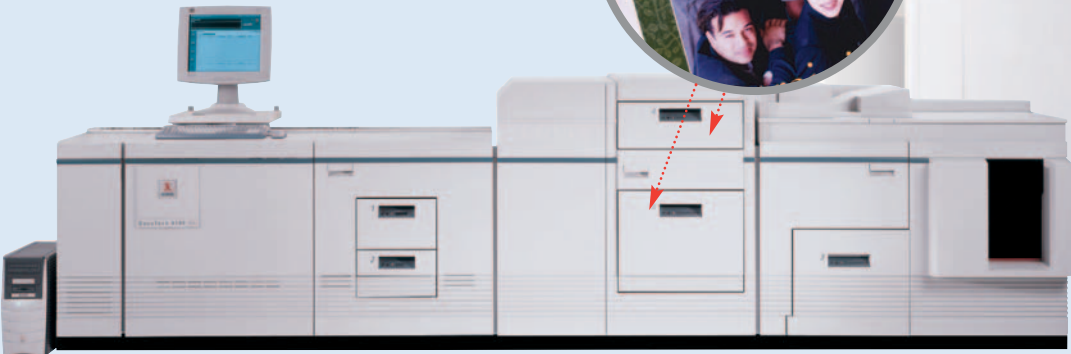
Documents are printed on a Xerox DocuTech Production Publisher.