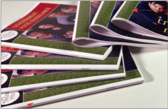
Document finished without the SquareFold Booklet Maker.