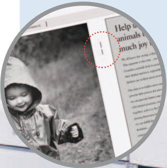
Sets are stapled, folded and trimmed.